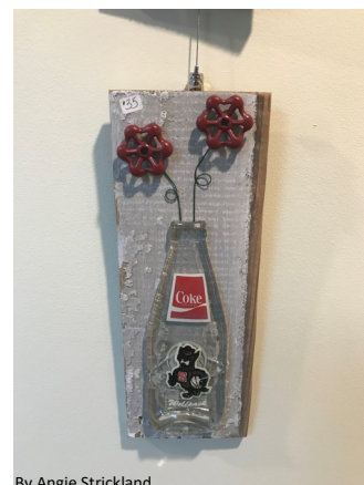
By Angie Strickland