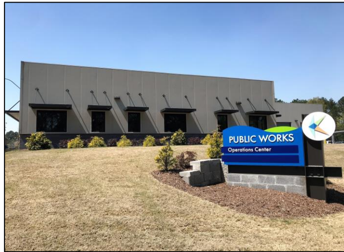
Public Works Facility

The Town Council will endeavor to successfully implement the Knightdale Strategic Plan. The Council will use the plan to guide its decision-making to ensure that their decisions are aligned with the objectives laid out in the plan. A key component of the plan is the identification and adoption of strategic priorities.