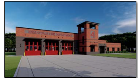
Fire Station #4 (Opening in FY24)

Knightsdale will continue to invest approximately $17.9 million in major capital projects for FY24. These projects represent multi-year fiscal investments. The Town will see significant completion of several major capital projects in the upcoming fiscal year.