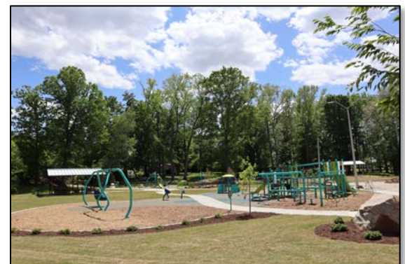
Harper Park Inclusive Playground (FY23 CIP Project)