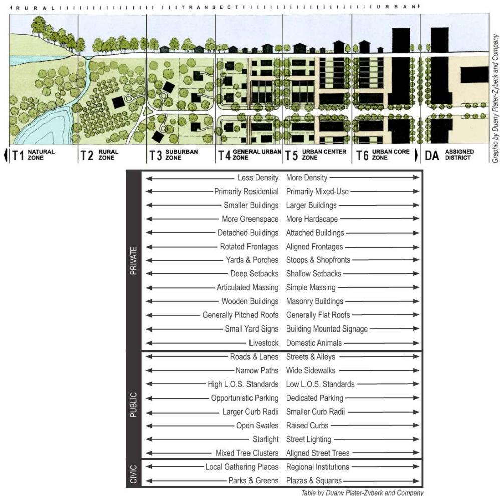
Figure 2.1: Rural-Urban Transect

The Zoning Districts for the Town of Knightdale have thus been ordered along this Transect providing an appropriate detailing of development at each end (rather than homogenous standardization) as well as a simplified tool for users of this Code to use to facilitate appropriate development. Figure 2.1 shows the defining features of various types of developments at either end of the Rural-Urban spectrum.