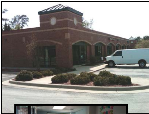
4023 CORNER SUITE