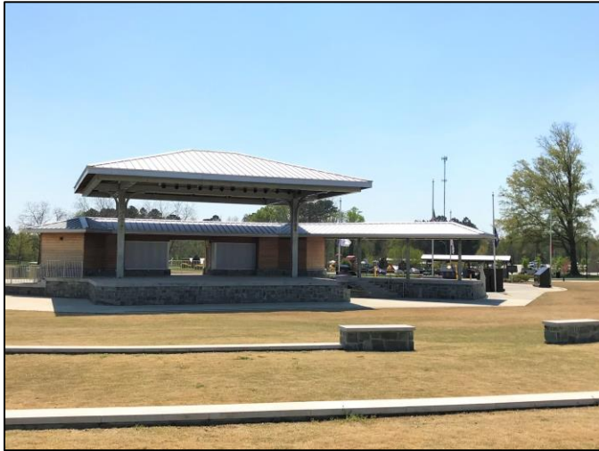
KSP Stage and Veterans Memorial