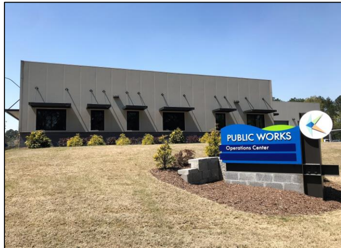
Public Works Facility

The Town Council will endeavor to successfully implement the Knightdale Strategic Plan. The Council will use the plan to guide its decision-making to ensure that their decisions are aligned with the objectives laid out in the plan. A key component of the plan is the identification and adoption of strategic priorities.